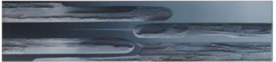
'Southern Current' Available