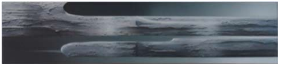
'Wairau Bar' Available